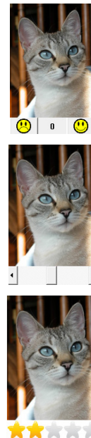
Figure 1. An overview of the proposed photo retouching system (left) and three different scoring methods (right)